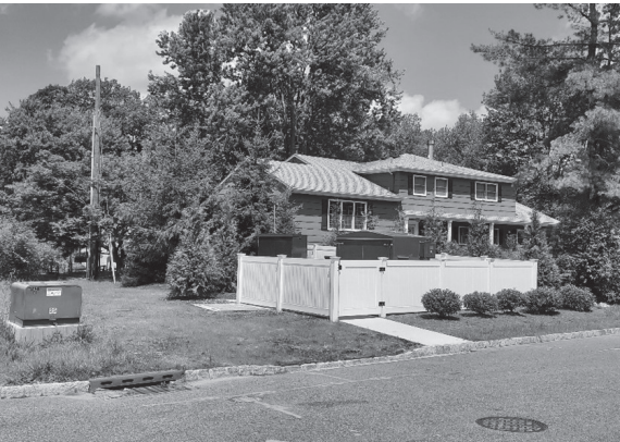
Meadowbrook Pump Station

The Meadowbrook Pump Station Upgrade Project had considerable delays due to equipment availability post-COVID, but is finally completed. Our great contractors at CFM Construction, Inc. continued to persevere through all of the equipment and material delays and completed the project in accordance with the design plans and specifications.