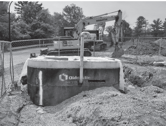
CCM Pump Station – New Wet Well

Construction has commenced on the township owned Sanitary Sewer Pump Station located on the County College of Morris (CCM) Campus, which includes the construction of a new pump station to replace the existing one. The township's contractor, Dulaine Contracting, Inc., is diligently working to have the majority of the pump station construction completed by the end of September 2023, with the new emergency generator installation slated for January 2024 due to equipment delays.