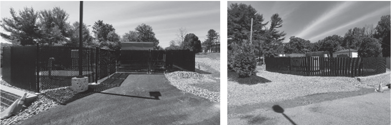
(CCM Pump Station)

Randolph Township is proud to announce that the CCM Sanitary Pump Station Replacement Project has been completed. Our great contractors at Dulaine Contracting, Inc. continued to persevere through some equipment and material delays to complete the project in accordance with the design plans and specifications.