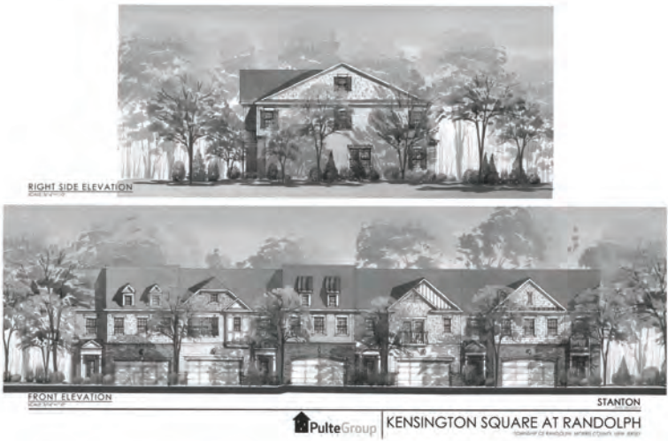
Artist's Rendering of Kensington Square Project

The Randolph Township Free Public Library recently completed an interior renovation. The newly decorated adult study space and water wall as well as the new meeting room are proving popular with library users.