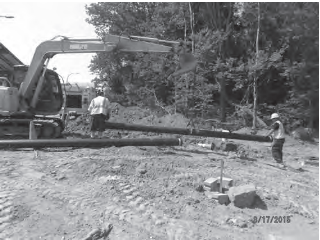
Water & Sewer Department crew installing a new water main for CCM.