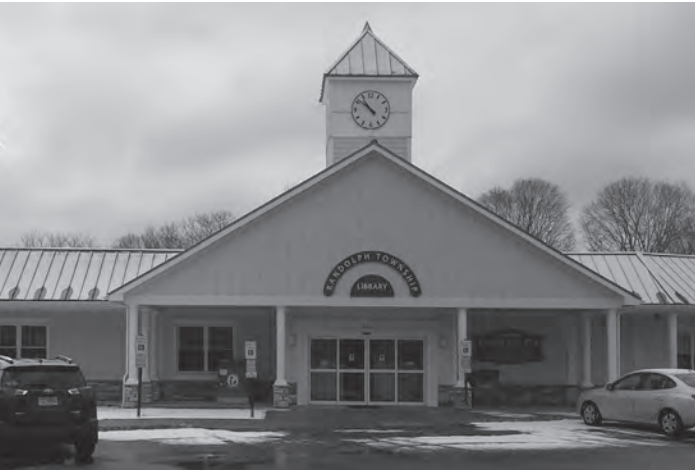
Randolph Township Library.