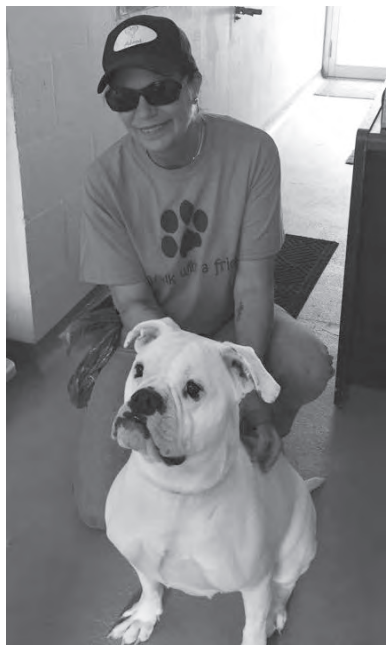
Animal Shelter volunteer with Opal, a Bulldog, who was adopted by a Randolph family.