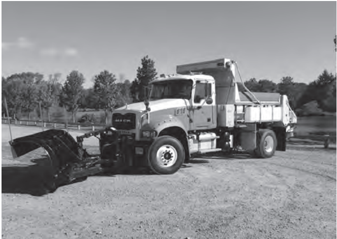
New 2015 plow truck with on-board chemical application system.