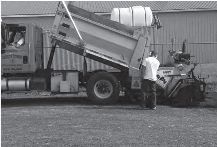
Public Works crew paving Recycling Center with shared-purchase paving machine.

This Division manages fleet maintenance for all Public Works vehicles, the township's police, fire, ambulance, and administrative vehicles. The maintenance and repair for the approximately 225 vehicles is performed in-house.