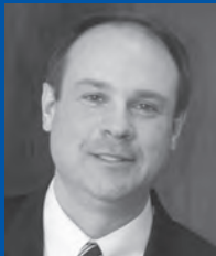
Roman Hirniak Mayor