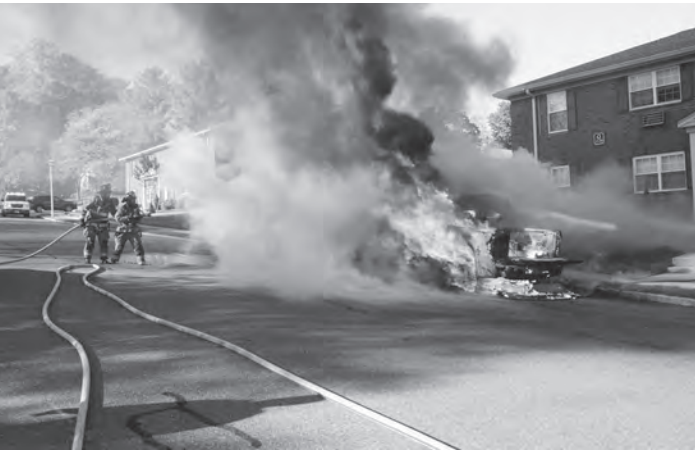
Members of the Randolph Fire Department extinguish a vehicle fire.

The Fire Department administrative offices are located in the Municipal Building at 502 Millbrook Avenue. The Fire Chief and Deputy Fire Chief may be reached by calling 973-989-7098. The Fire Official and Fire Inspectors may be reached at 973-989-7039; both numbers have voice mail. You may reach individual fire company officers by calling the phone numbers provided. The best time to reach someone is any Monday evening between the hours of 7:00 pm and 9:00 pm.