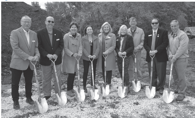
Members of the Township Council, the Township Manager and representatives from Morris Habitat for Humanity

Morris Habitat for Humanity is hoping to 'cut the ribbon' on the first completed affordable unit in 2022. The 25 units will be built on the site across four buildings, along with a community center, a playground and a gazebo. The Bennett Avenue project is the largest in the organization's thirty-five year history. To support this ambitious undertaking, Morris Habitat for Humanity is actively raising capital through a variety of different fundraising efforts. For more information on how to donate to the project, residents are encouraged to visit the Morris Habitat for Humanity website, morrishabitat.org .